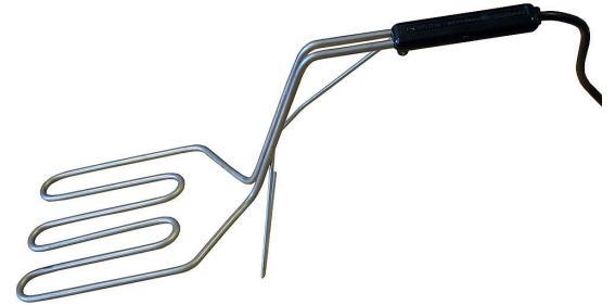
For kettle grills

A barbecue lighter from Backer lights the grill without barbecue fluid and therefore has less influence on the environment and it doesn't affect the taste of the food. In 20 minutes you have perfectly glowing charcoal, which enables planning of the barbecue process.